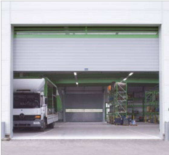
The big one – Albany RR3000 XXL