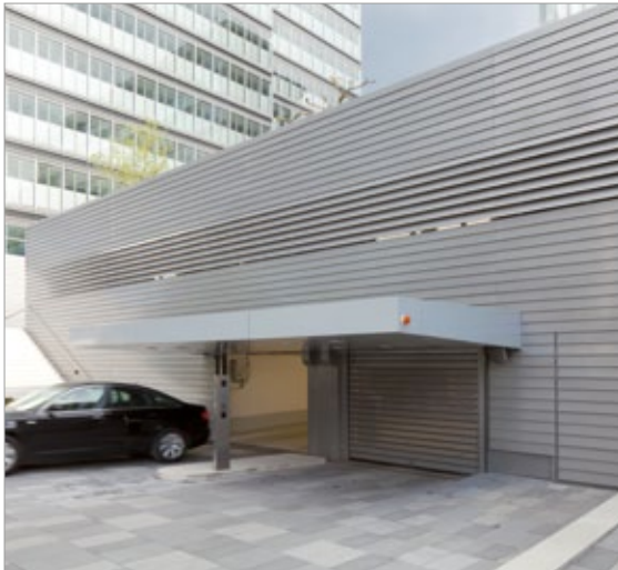
The space-saver – Albany RR3000 R