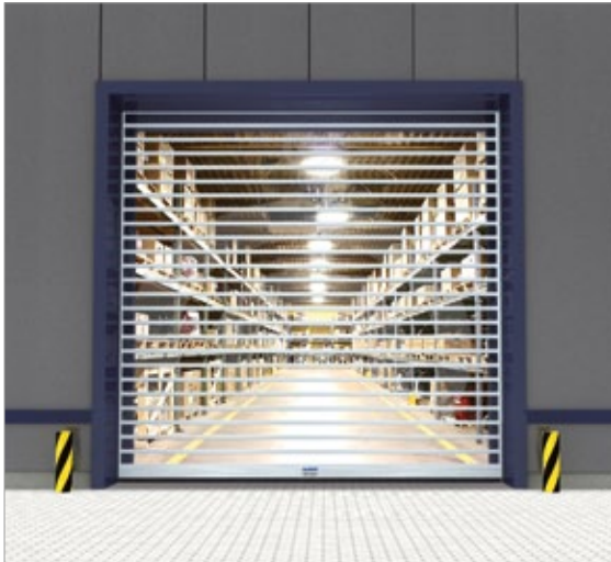
The transparent one – Albany RR3000 Vision