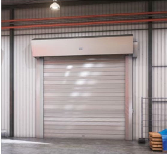
The energy-efficient one – Albany RR3000 ISO