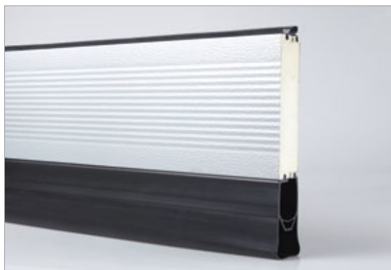
Thermally insulated sandwich lamellas Type RR3000 ISO

The door Albany RR3000 ISO is equipped with highly thermally insulated sandwich lamellas consisting of foam (thickness 50 mm) covered by metal sheet trays in silver (RAL 9006). The k value (heat transfer coefficient) for the curtain achieved with this is 0.9 W/m 2 K and 1.5 W/m 2 K for a complete door (example: 4 x 4 m). Optionally lamellas with shockproof Polycarbonate panels can be integrated in the door blade, gaining a transparency of up to 67%.