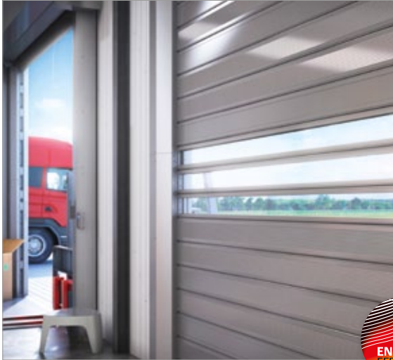
Albany RR3000 ISO with windows